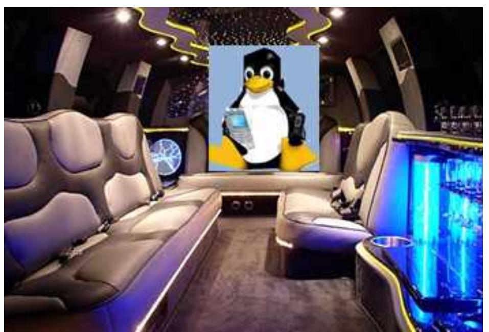
LiMo's initial Founder members—Motorola, NEC, NTT DoCoMo, Panasonic Mobile Communications, Samsung Electronics and Vodafone—have been joined by others so now there's 40+ members..

LiMo Foundation, a global consortium (let's just say you won't find Microsoft or Nokia on this list) , launched the first globally competitive Linux-based software platform for mobile handsets in March—together with public availability of the application programming interface (API) specs.